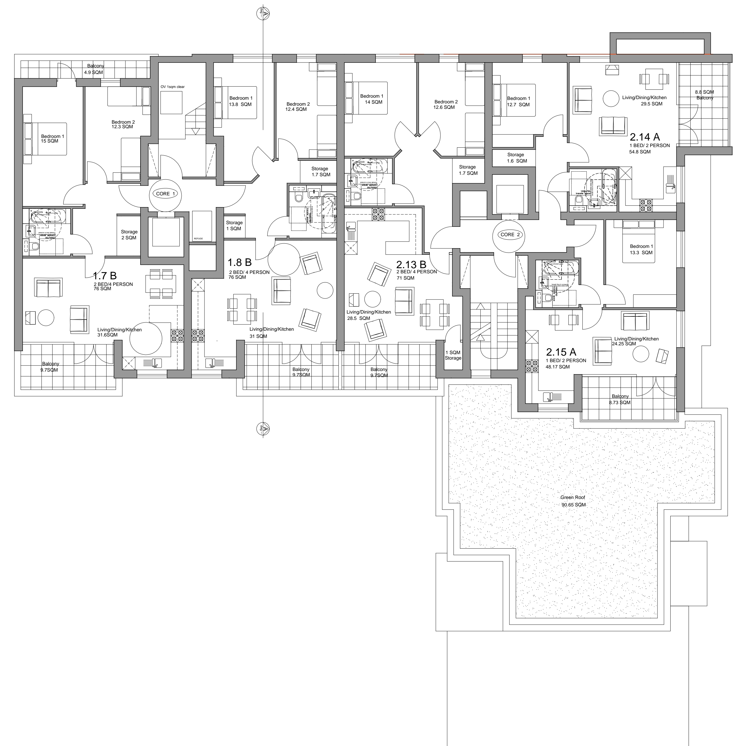
PROPOSED FOURTH FLOOR PLAN