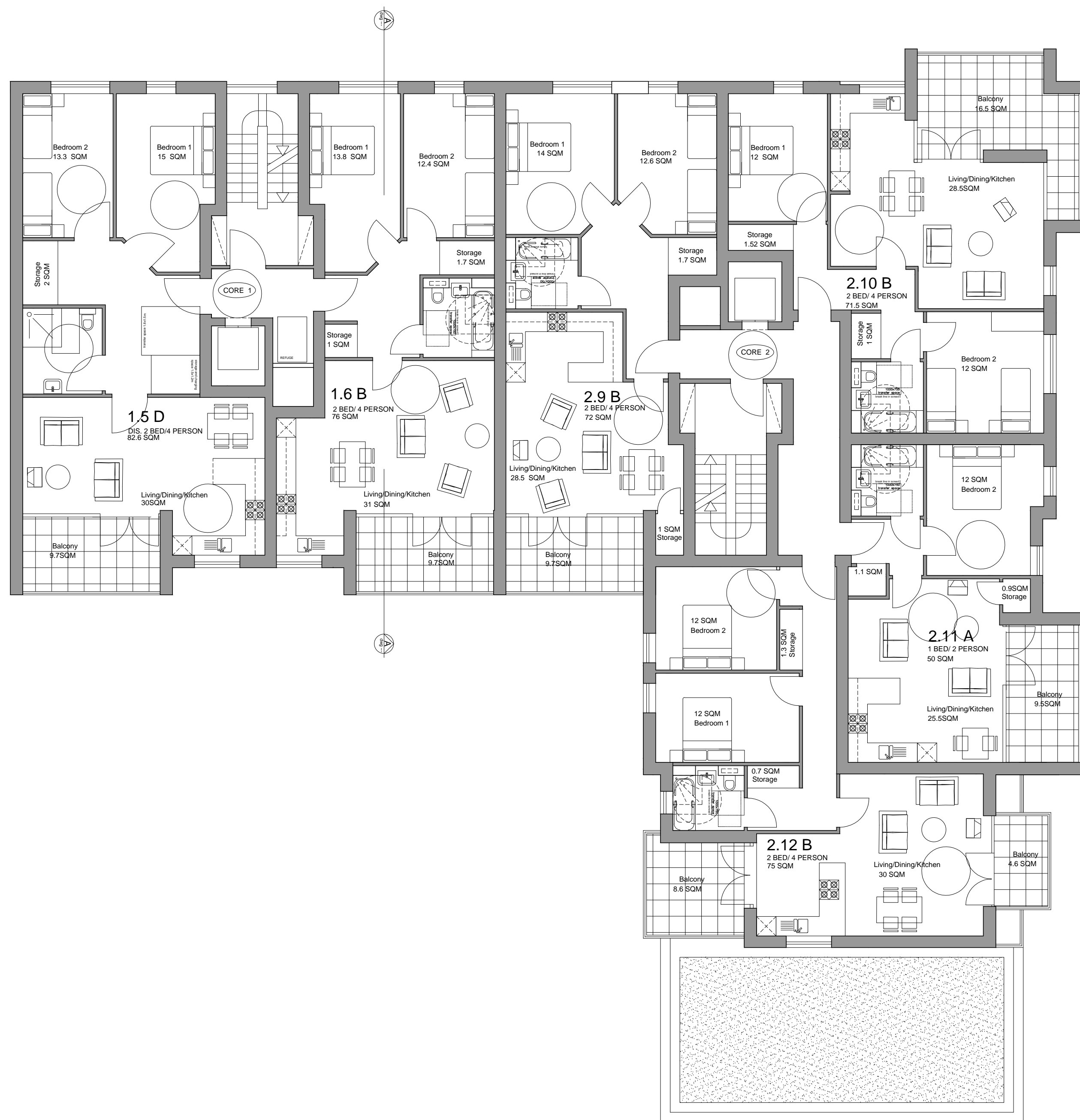
PROPOSED THIRD FLOOR PLAN

Note: All dimensions to be checked on site before the commencement of the work. If this drawing exceeds the quantities in any way the architects are to be informed before work is commenced. Do not scale this drawing. This drawing is copyright.